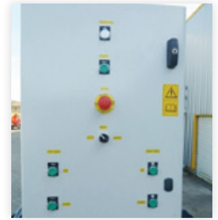
Central electric box