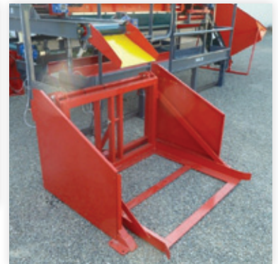
Filling box tipper