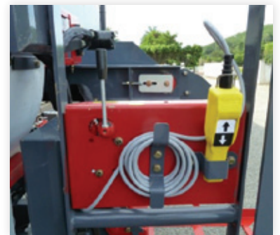
Manual / electric controls