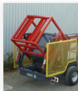
Feeding box tipper