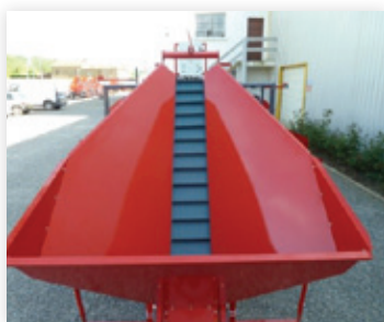
Large feeding hopper