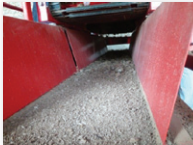
Soil evacuation belt