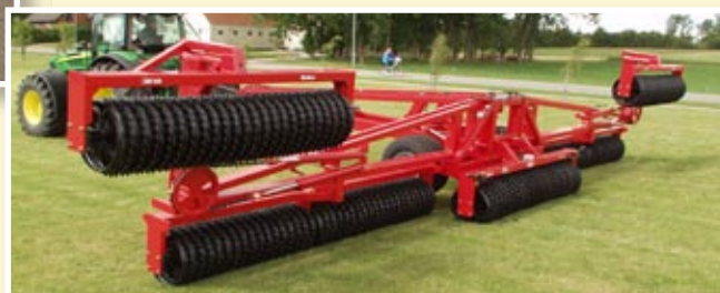
The King-Roller quickly folds down horizontally to a transport width of less than 3 m.

All five roller sections are centre suspended and with independent flotation resulting in a perfect contour following of the King-Roller. Moreover, the centre section follows the contour of the field independently of the tractor, as the drawbar is equipped with a pivotal towing eye.