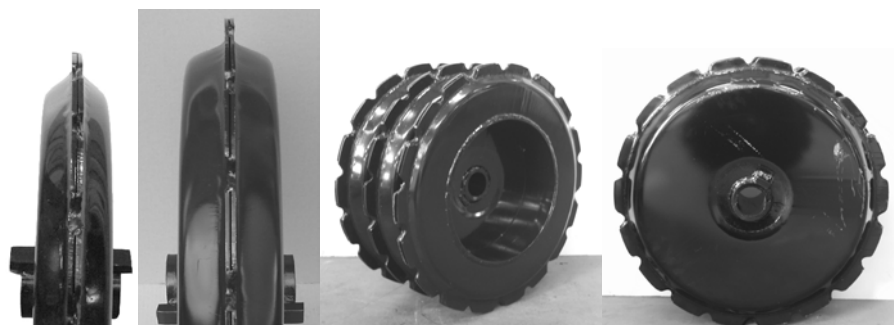
600 mm 700 mm

Diameter: 600 mm & 700 mm Closed steel ring made of 4/5 mm pressed plate and welded together which results in a high strength. Due to this strength the ring is efficient in stony soils. The castellated ring ensures an efficient consolidation of new ploughed soil before seeding. The ring is also used in connection with reduced soil preparation and stubble preparation.