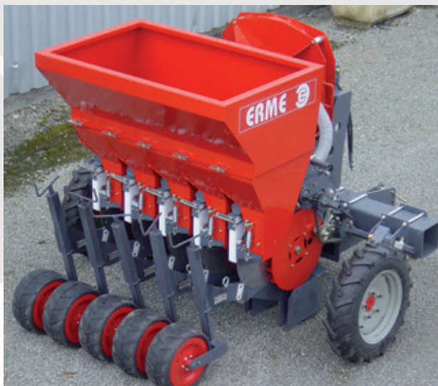
OPTION Special 25cm spacing equipment for onions