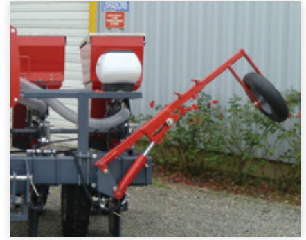
OPTION Insecticide micro granulator Tractor wheel markers (mechanical/ hydraulic)