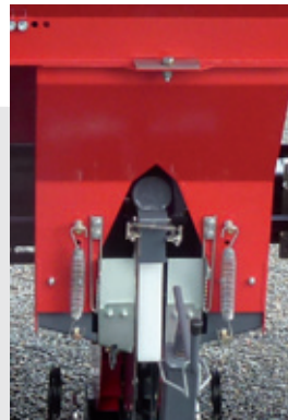
Easy hopper emptying flap