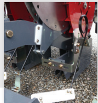
Rear soil scrapers for double rows