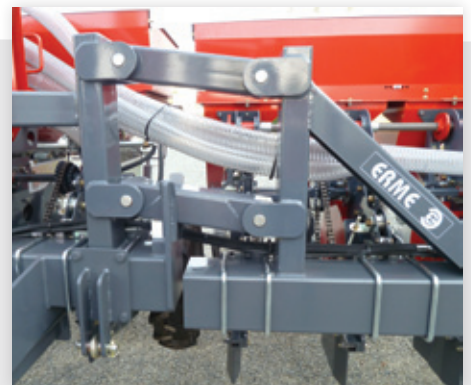
OPTION Reinforced chassis with parallelogram frame for multi bed machines