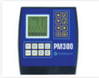
OPTION Cabin planter controller