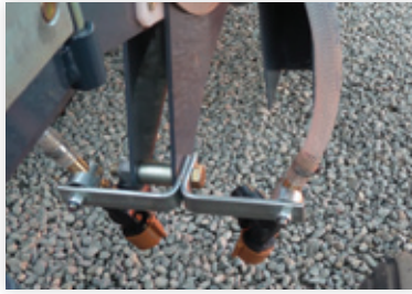
OPTION Liquid spraying system